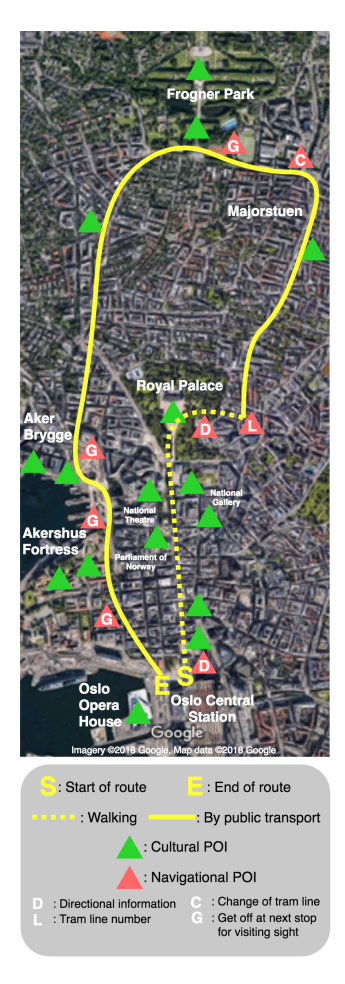
Figure 5: The route and the POIs of the AudioTransit study.

sample size. Overall, an iterative design process based on the collected user feedback will take place, leading up to a large-scale evaluation of AudioTransit in the context of tourist groups of two or more users.