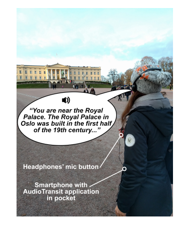
Figure 2: Using AudioTransit to explore Oslo on foot. The user approaches a place of cultural interest and an audio track with cultural information plays automatically.

provide location-based auditory information about nearby sights, minimising the distractions from interacting with mobile devices, and ultimately freeing the users' eyes to observe their surroundings and new environments [2]. Over the years, audio AR tour guides have found application in indoor settings (e.g. museums) [1, 17] and outdoor confined spaces (e.g. zoos) [12, 14].