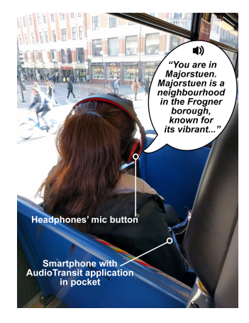
Figure 3: Using AudioTransit to explore Oslo by tram. User gets cultural information about the surrounding area.

Cultural POIs: Sights and city areas of cultural interest that trigger audio tracks with cultural information, e.g. history, architecture, visiting hours. Navigational POIs: Places of navigational interest, such as bus/tram stops, that trigger audio tracks with practical, navigational information, e.g. bus/tram number, change of tram line, or the next stop being close to a sight.