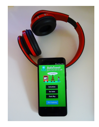
Figure 1: The AudioTransit tour guide system setup (main menu screen).