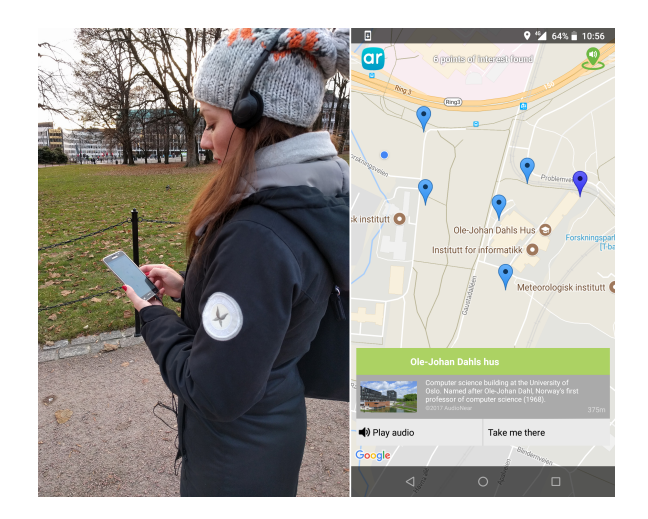
Figure 3: Route planning/navigation functionality: the user utilises the AudioNear map to navigate around Oslo and its tourist sights (left) . A screenshot of the AudioNear map (right) .

Even if distraction is minimised, auditory content can still cause cognitive load if it depends on instructions for interpretation [24]. To minimise the user's cognitive effort, AudioNear utilises intuitive interaction metaphors for conveying navigation and sight-related