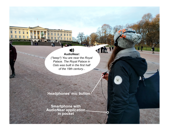
Figure 2: Exploration functionality: the user utilises AudioNear to explore Oslo. When the user approaches a landmark (Royal Palace), an audio track with cultural information begins to play.

(buildings, landmarks, monuments, etc.) that are located in the vicinity.